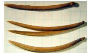
Piñon remains from packrat middens in the Crawford Mts.